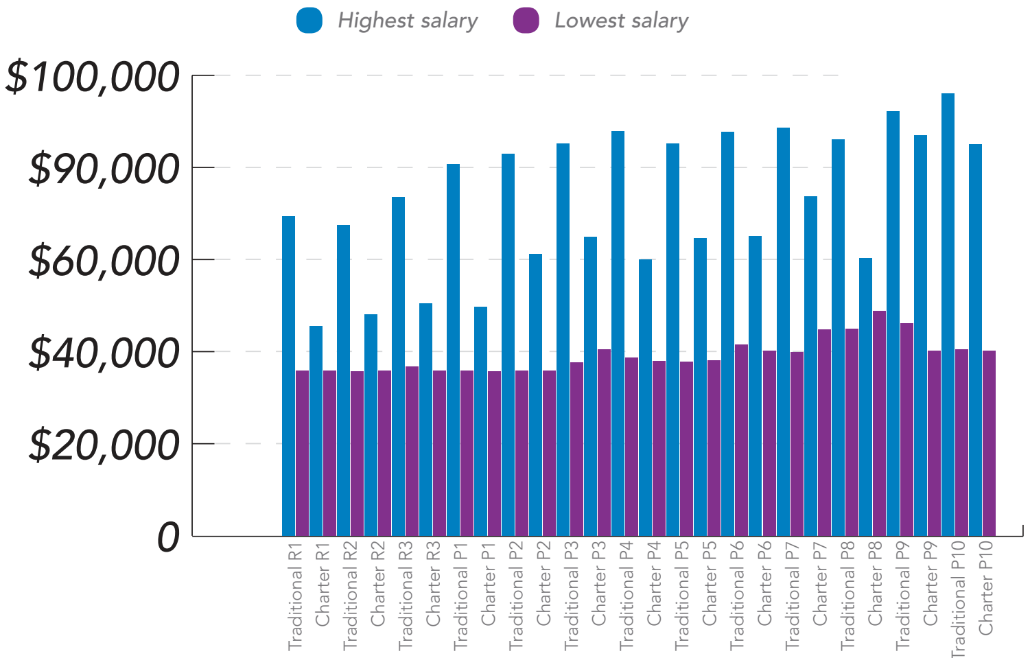
Graph 2. Highest and lowest salaries by Career Ladder rung

In short, salaries are not always commensurate with the Career Ladder rungs — and are not required to be.